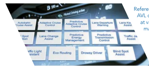
Reference list of AVL contributions at various car manufactures

Automated driving level zero to two features e.g. lane departure warning