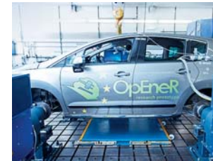
OpEneR driving strategies for electrical efficiency, range and safety