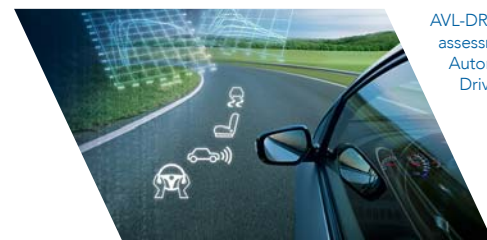
AVL-DRIVE™ for assessment of Automated Driving features