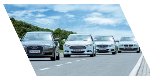
Benchmarking database for high number of vehicles with newest ADAS