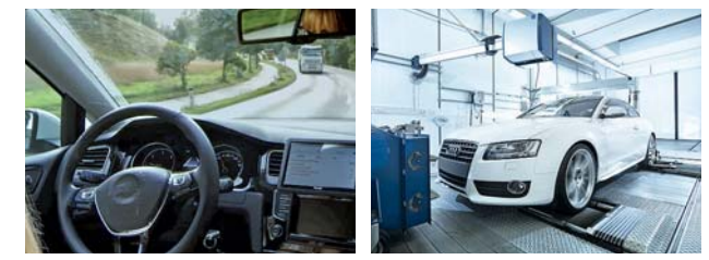
Calibration testing of automated functions on road